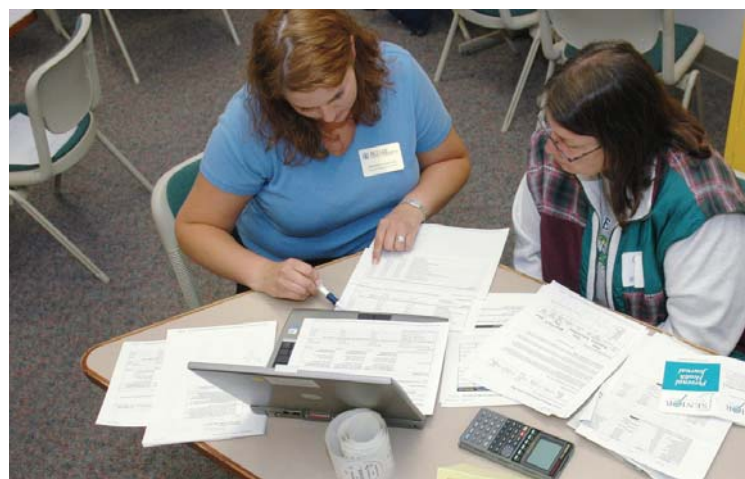
Butler students help seniors sign up for the Medicare D program.