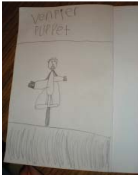
Jonah wrote about puppets during Writer's Workshop.